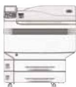
2nd Tray with Castor 1,360 sheets