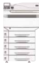
2nd Tray with HCF 2,950 sheets