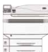
2nd Tray 1,360 sheets