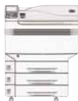
2nd + 3rd Tray with Castor 1,890 sheets